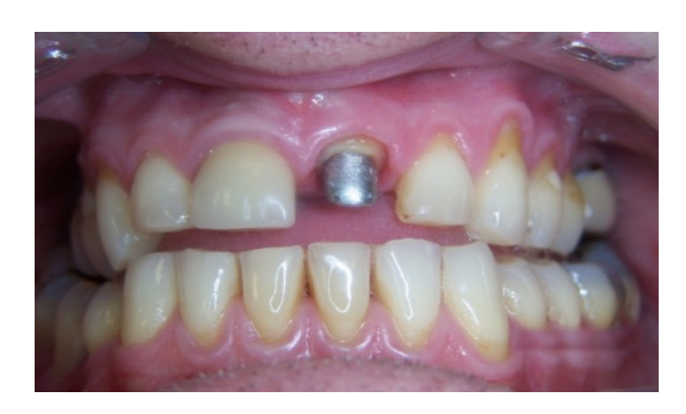
Post crown which replaces the natural crown entirely and retains itself by means of a dowel (post) extended inside the root canal space.